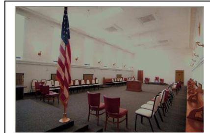
Remodeled Lodge Room/DeMolay Chapel

Also, the board formed a committee to assess and to prioritize projects that will improve our Cathedral. The board has met for two quarterly board meetings since then and has approved funding for a number of improvements to our Cathedral. In fact, if you haven't visited lately, you'll be pleased to see the recently renovated dining room restrooms. The main goal of this renovation was to enable the Cathedral to appeal to discerning clients interested in renting our dining room facility for weddings or corporate affairs, thus increasing revenue potential for the Valley.