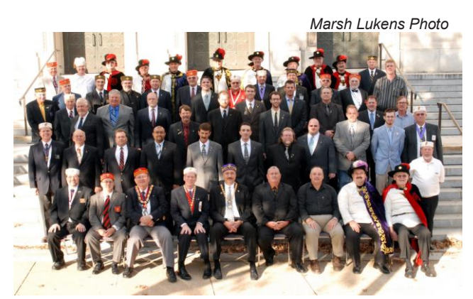
Fall Reunion Class - Valley of St. Louis

Earlier this year I received a note from a Brother who lives quite a distance from St. Louis. He asked, "What's in it for me? Why should I keep up my membership?" thought of a response, I couldn't help but think of the Masonic Education we receive from the Scottish Rite. We learn the meanings of those key words and precepts of Freemasonry: Wisdom, Strength, Beauty, Love, Relief, Truth, Temperance, Fortitude, Prudence and Justice. To use a modern term, we learn the true value of "networking", not the kind based on greed, but based on the Masonic precepts explained in the Scottish Rite Ritual. We learn that every Brother we meet on the face of the Earth has stood or knelt before an altar and professed the same precepts, beliefs and values that we hold so dear in our own hearts. We know that we can without reservation associate, deal and socialize comfortably with those who feel in their hearts the same as we do. That's what's in it for me! Priceless, isn't it? I hope you find the same value in it for you!